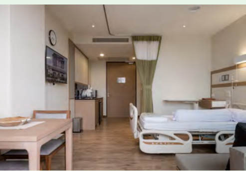
*Inclusion: Regular room charge for 15 nights, 3 meals per day and 3 COVID-19 tests (on day 0, 5 and 14) with daily fever monitoring.